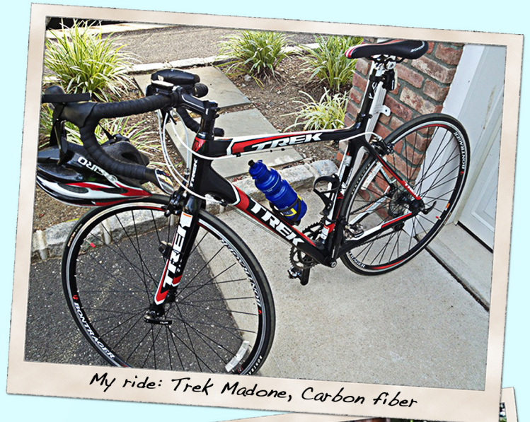
My ride: Trek Madone, Carbon fiber