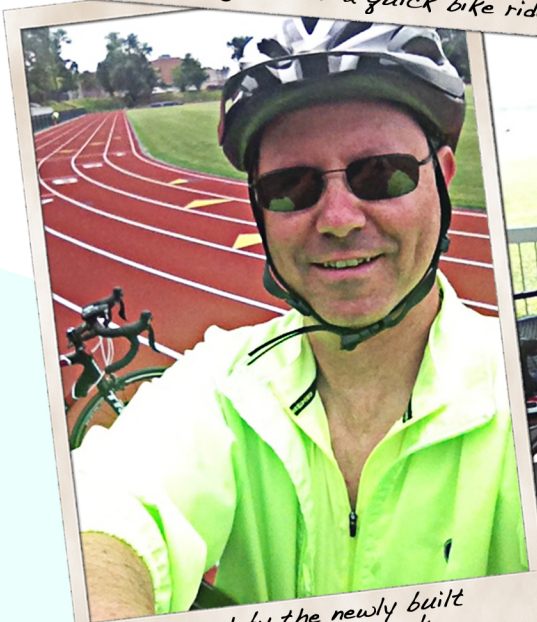
Stopped by the newly built middle school track