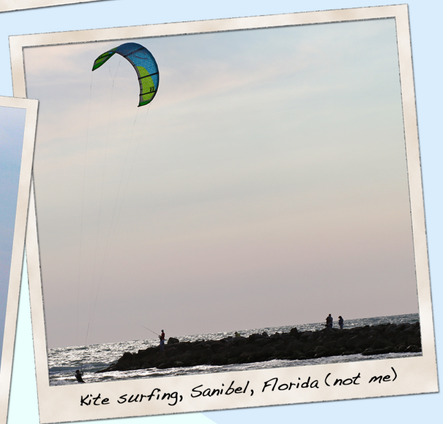
Kite surfing, Sanibel, Florida (not me)