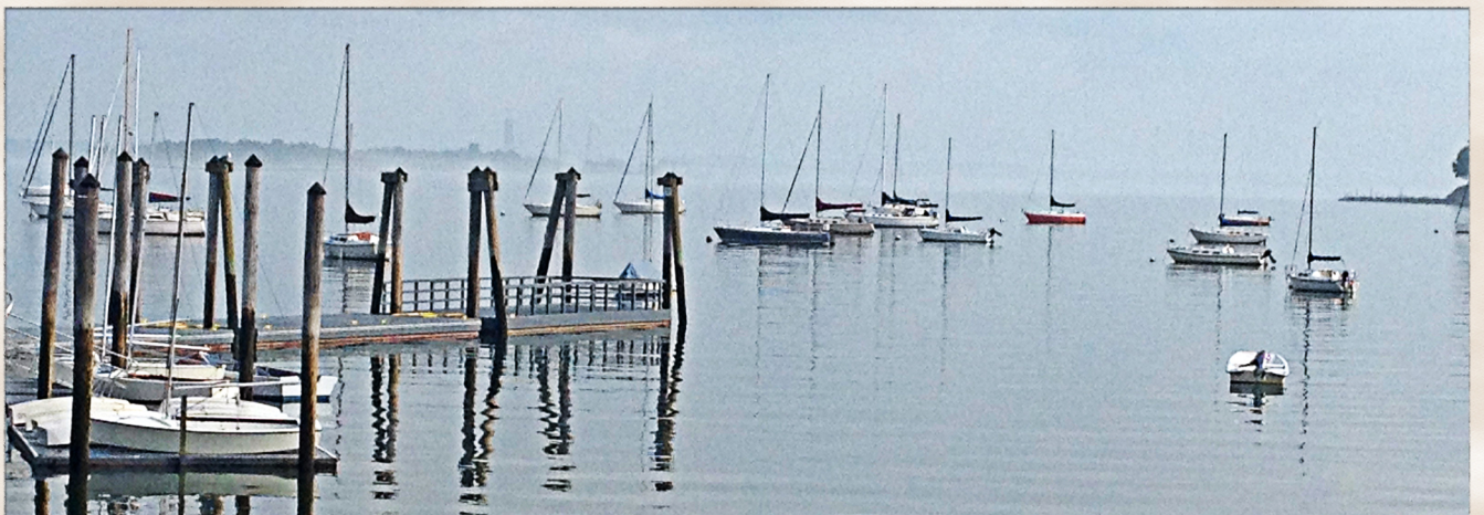
Steppingstone Park, Kings Point on a quiet Sunday morning bike ride