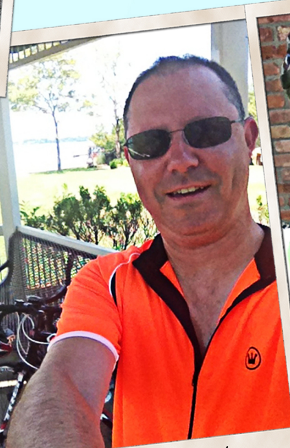
Biking in Great Neck