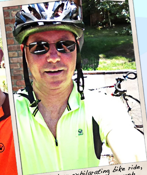
Finished an exhilarating bike ride, 22 miles, top speed 32 mph