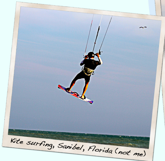
Kite surfing, Sanibel, Florida (not me)