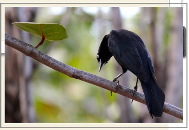
A scavenger looking for food at the waterside restaurant.

My goal, as an experienced trial attorney, is to provide guidance to you so you can make the best educated decision possible about what to do next.