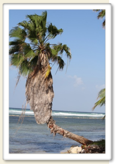
These trees took a little detour